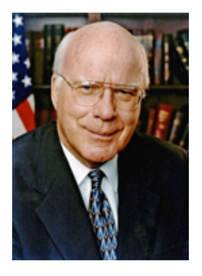
Senator Patrick Leahy

According to a statement from the desk of Senator Patrick Leahy (D-VT), "Senators Reid, Schumer, and Menendez have released a productive framework for the process of drafting comprehensive immigration reform legislation." Among the many reforms included in the proposal is a permanent extension of the EB-5 Visa program, which Senator Leahy supports.