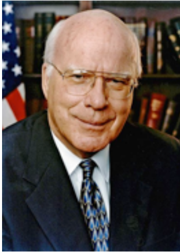
Senator Patrick Leahy

According to a statement from the desk of Senator Patrick Leahy (D-VT), “Senators Reid, Schumer, and Menendez have released a productive framework for the process of drafting comprehensive immigration reform legislation.” Among the many reforms included in the proposal is a permanent extension of the EB-5 Visa program, which Senator Leahy supports.