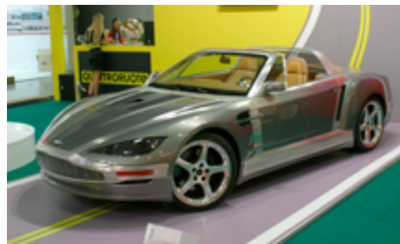
Giugiaro-Designed Concept Car